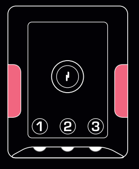
Opening: Select your chosen code and push the side buttons