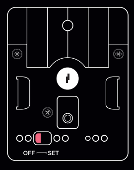
Move switch to 'OFF'