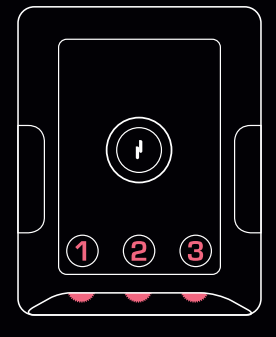
Select a 3-digit code