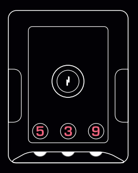
Closing: Shut the lock buckle down and change code